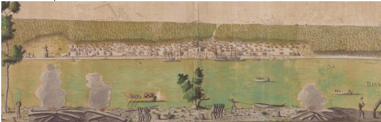
Detail of Vue et Perspective de la Nouvelle Orleans by Jean-Pierre Lassus (1726) showing slave labor at Company Plantation in foreground.

Above all, it functioned as a jail-like compound for those captive Africans who survived the wretched Middle Passage and arrived to New Orleans in chains. To the Company Plantation landed many, probably most, of the 6000 people forcibly shipped into Louisiana from the Senegambia, Bight of Benin, and Congo regions of West Africa during the French colonial era. From this spot, most were sold into slavery and sent off to clear forests and cultivate fields; some were held in bondage by the Company itself and put to work locally. It’s no coincidence that the three-hundredth anniversary of Algiers is also the three-hundredth year since institutional slavery arrived to Louisiana, and that both shortly followed the establishment of New Orleans.