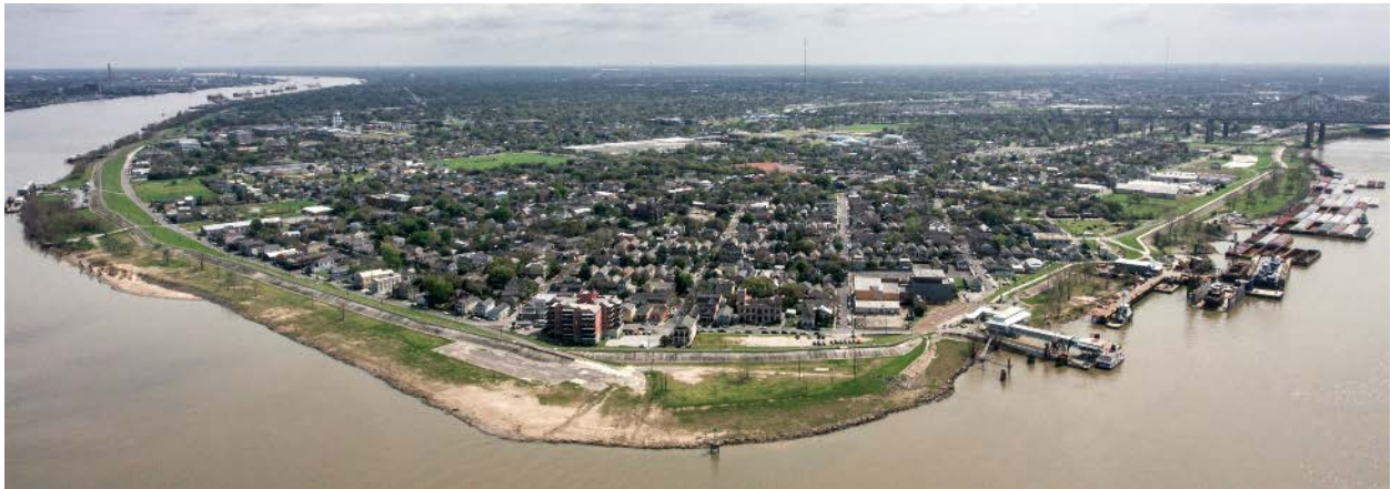
Drone photo of Algiers by Lorenzo Serafini Boni, 2017.

In 1895, a great fire destroyed Algiers Point, including the Duverjé House. The beautiful late-Victorian neighborhood we know today was built mostly in 1896, including the present-day Algiers Courthouse—all within the same street grid surveyed in 1821, upon lands first settled over a century prior.